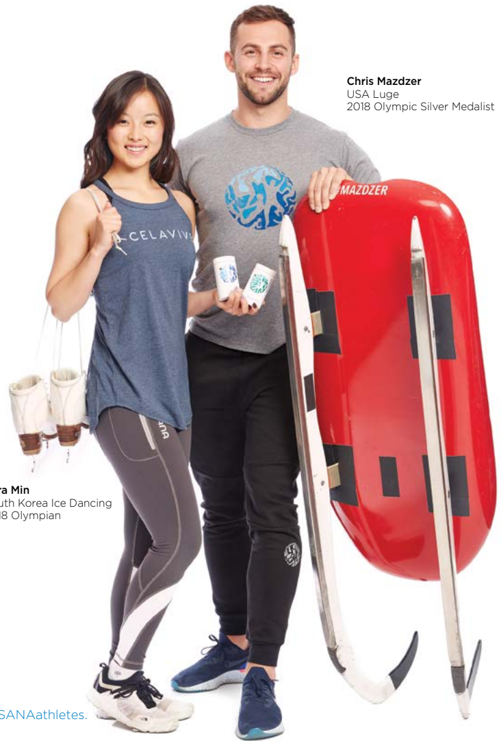
Chris Mazdzer USA Luge 2018 Olympic Silver Medalist

Follow USANA Athletes on Instagram @TeamUSANA @USANAathletes.