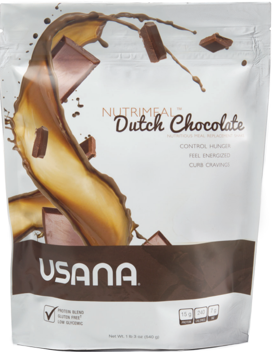
#210 DUTCH CHOCOLATE (9 servings)