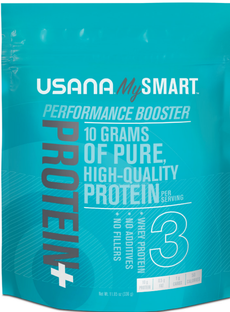
#208 PROTEIN PLUS BOOSTER (28 servings)

Add an extra boost to the protein base of your choice to make your shake exactly what you want and need.