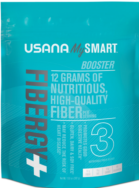
#226 FIBERGY® PLUS BOOSTER (28 servings)

Mix your shake up a bit with an extra 12 grams of fiber to help keep you fuller, longer.