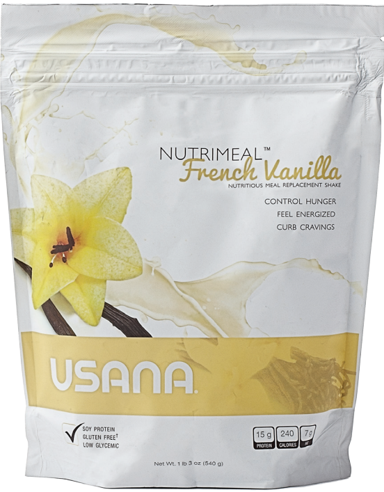
#211 FRENCH VANILLA (9 servings)