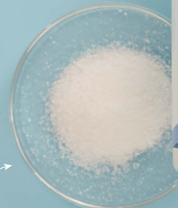
Vegetarian Glucosamine Hydrochloride