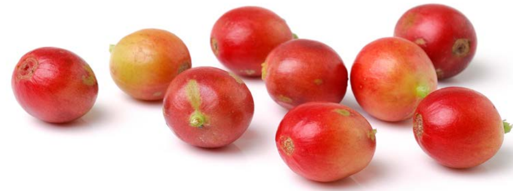
Whole Coffee Fruit Extract