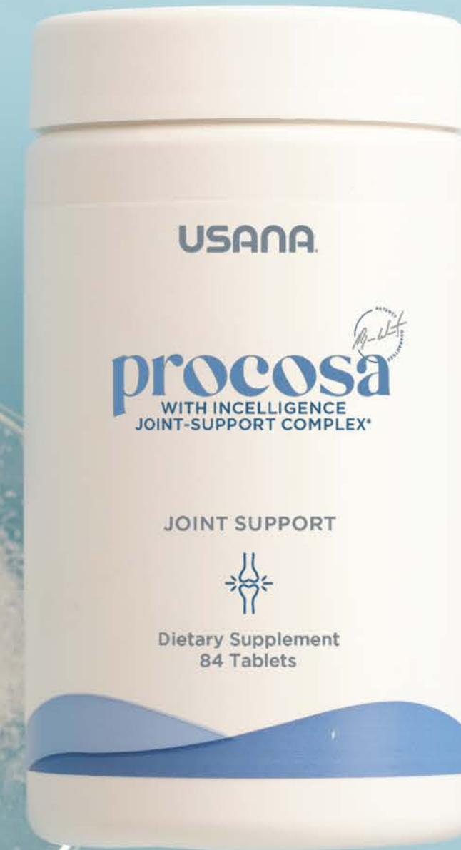
Meriva Bioavailable Curcumin