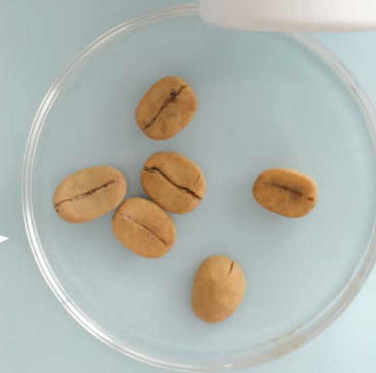
Whole Coffee Fruit Extract