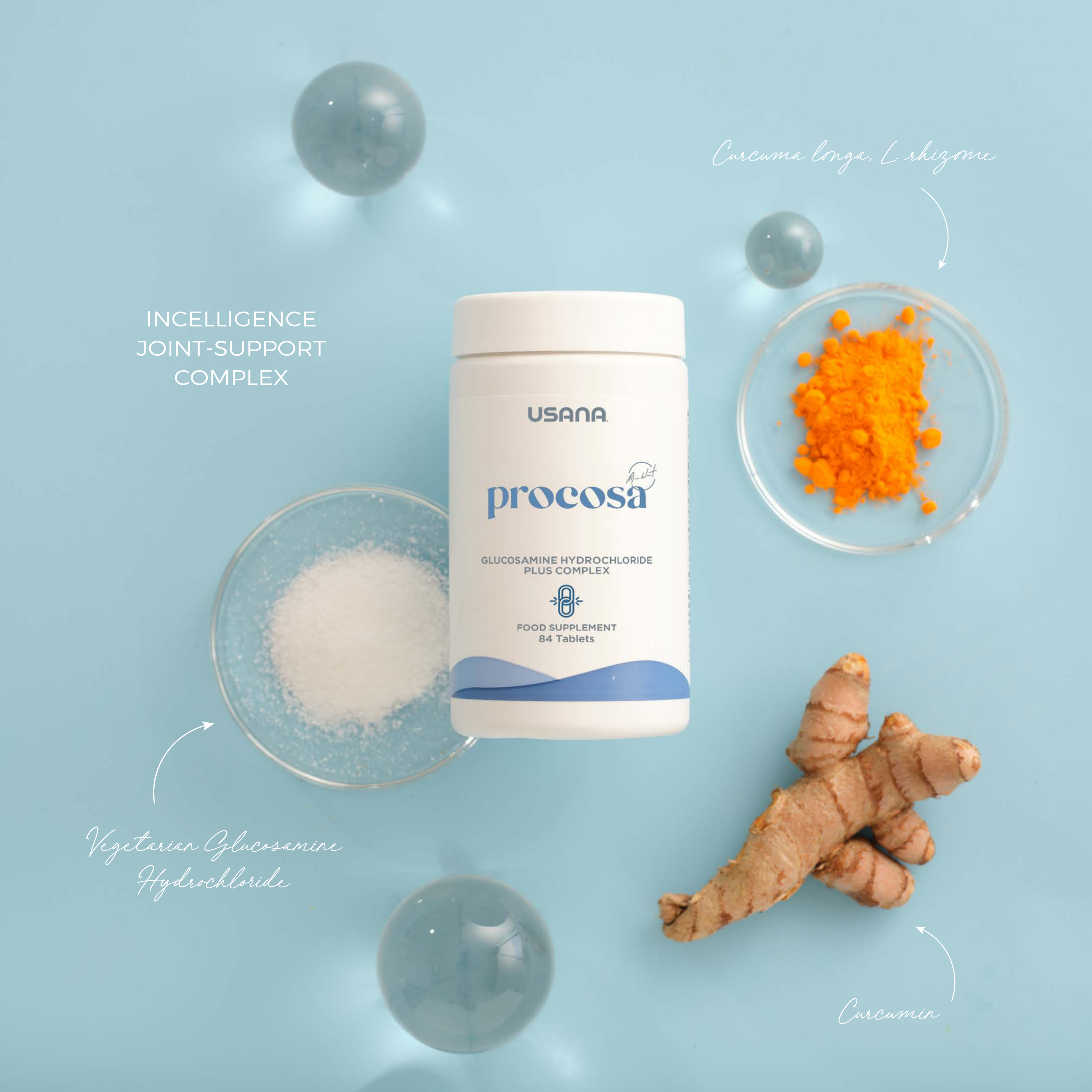
INCELLIGENCE JOINT-SUPPORT COMPLEX

USANA's Procosa provides essential building blocks for compounds needed to support normal joints. In addition to its InCelligence Joint-Support Complex, Procosa also includes vitamin C and minerals that work together support normal joint function.