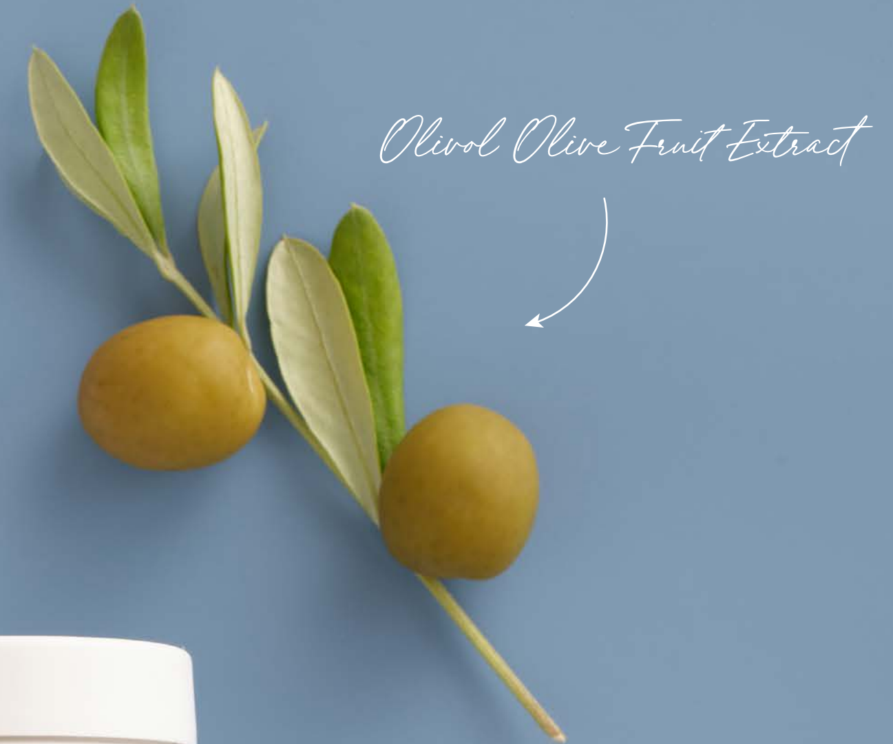
Olivol Olive Fruit Extract