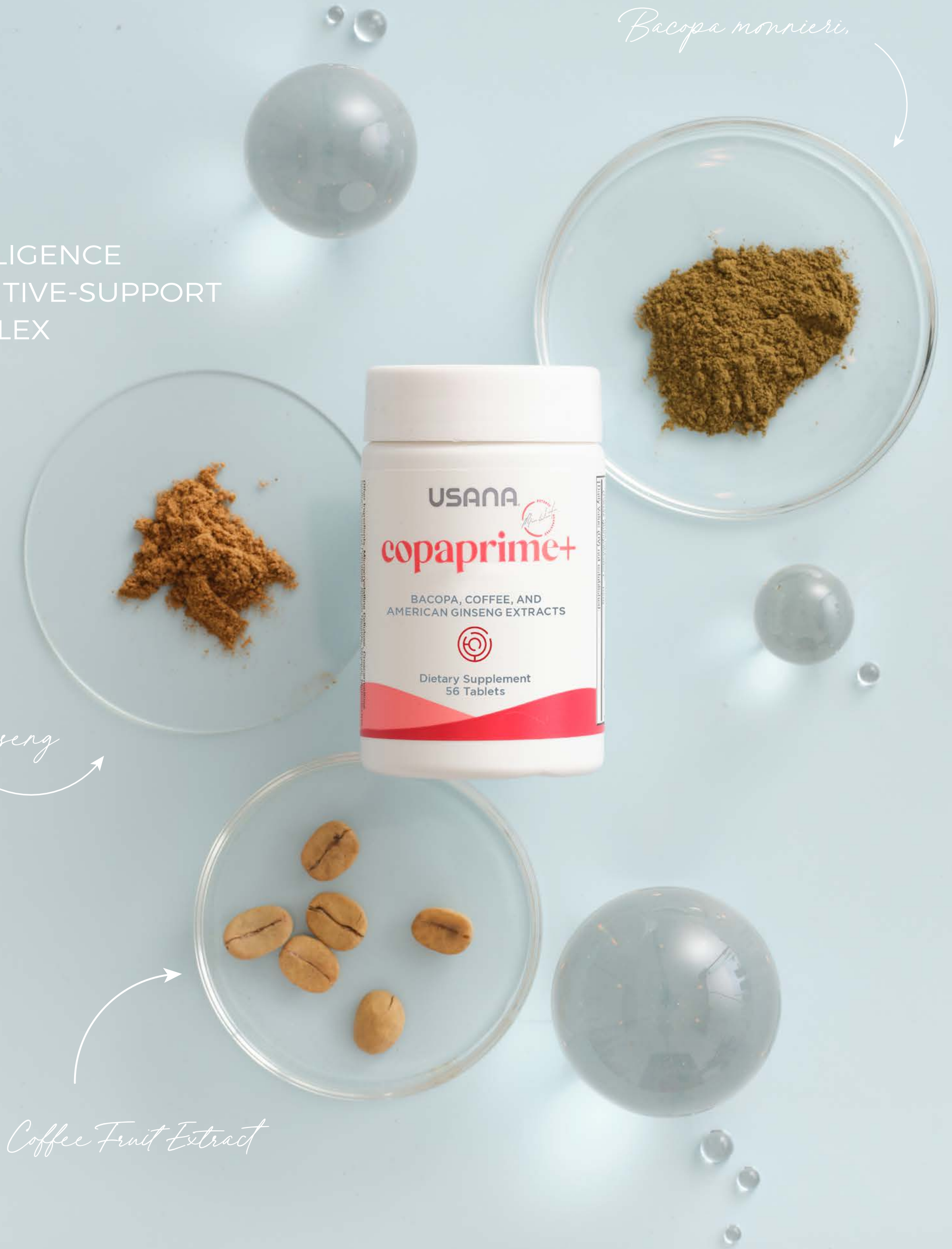
Whole Coffee Fruit Extract