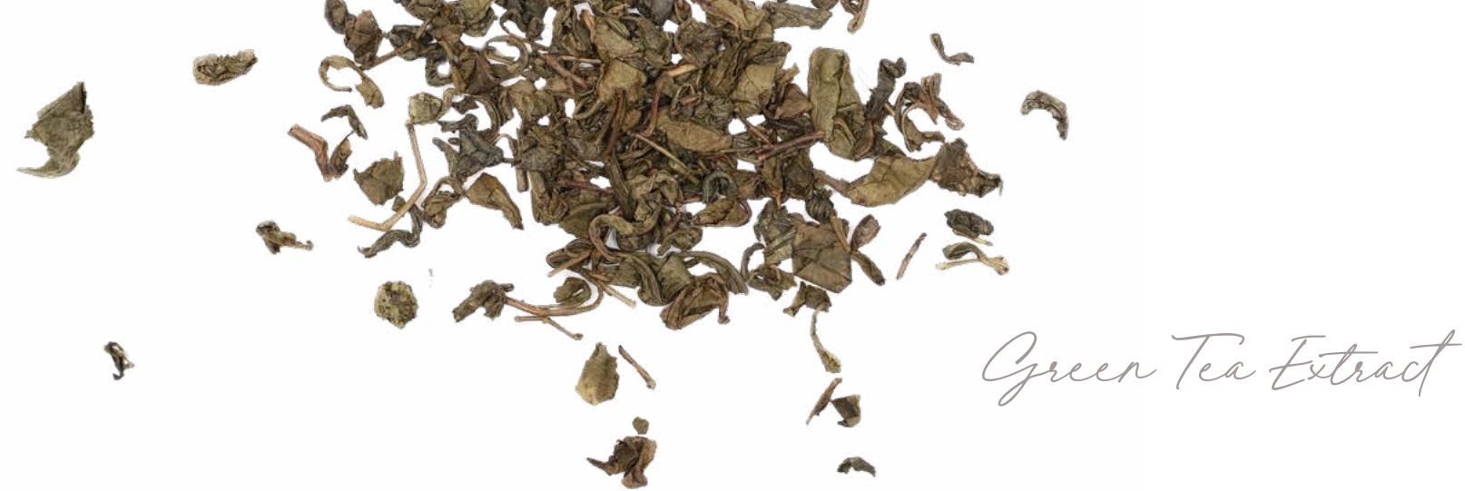
Green Tea Extract