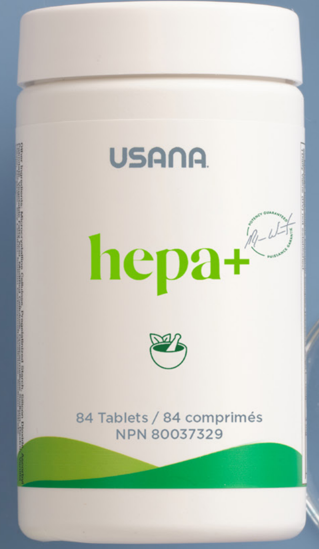
INCELLIGENCE DETOX-SUPPORT COMPLEX