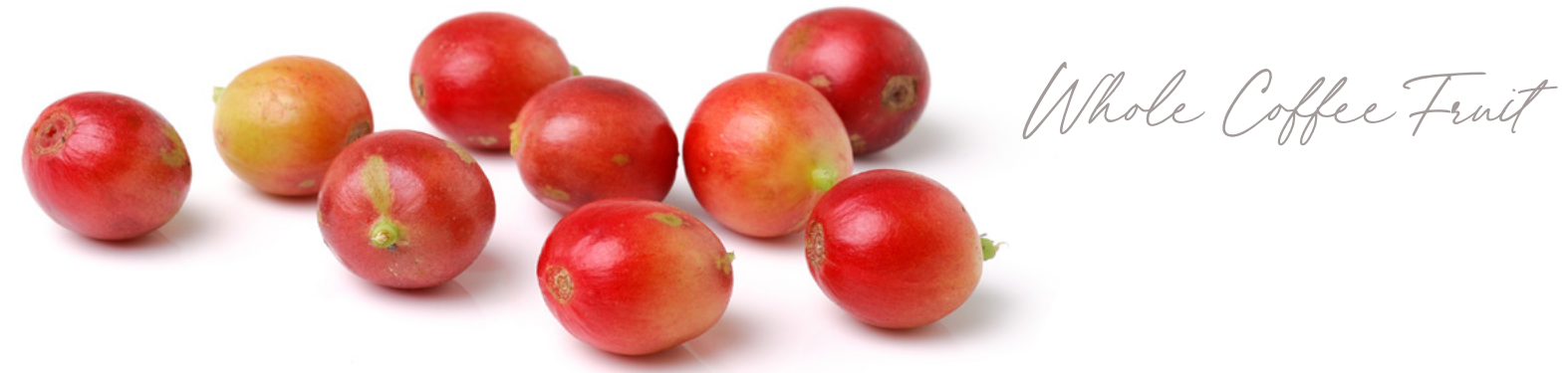
Whole Coffee Fruit