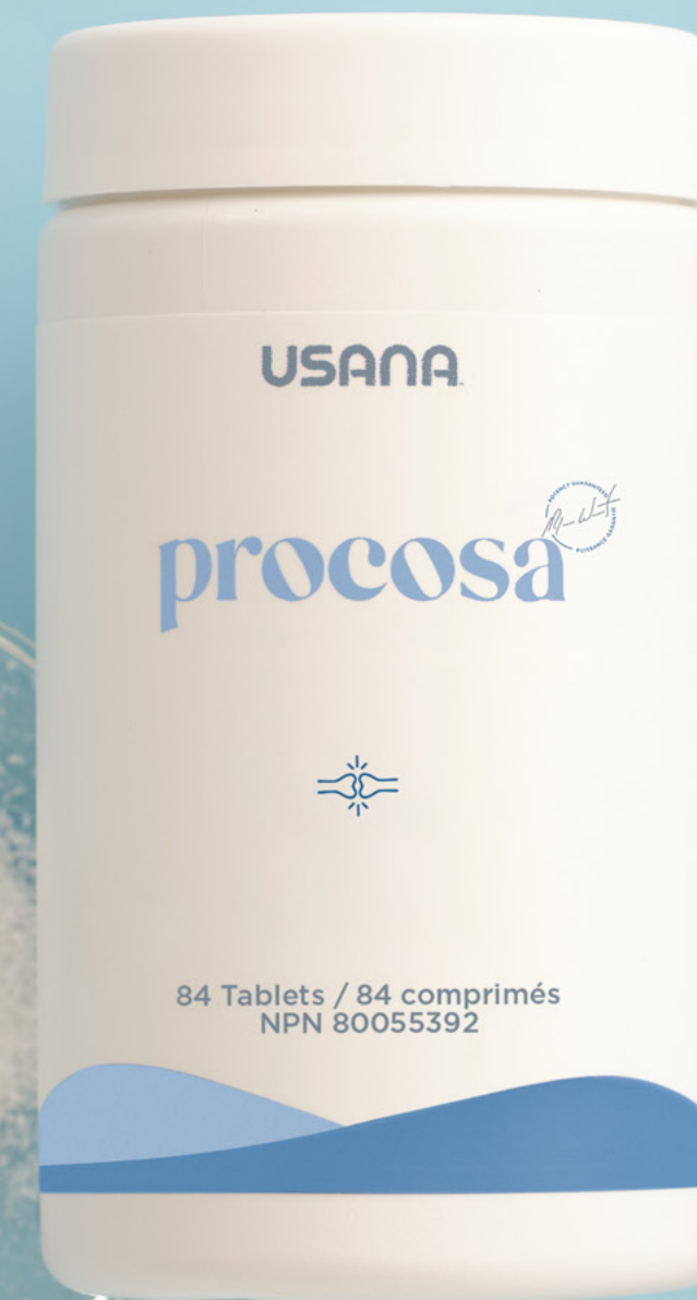
Meriva Bioavailable Curcumin