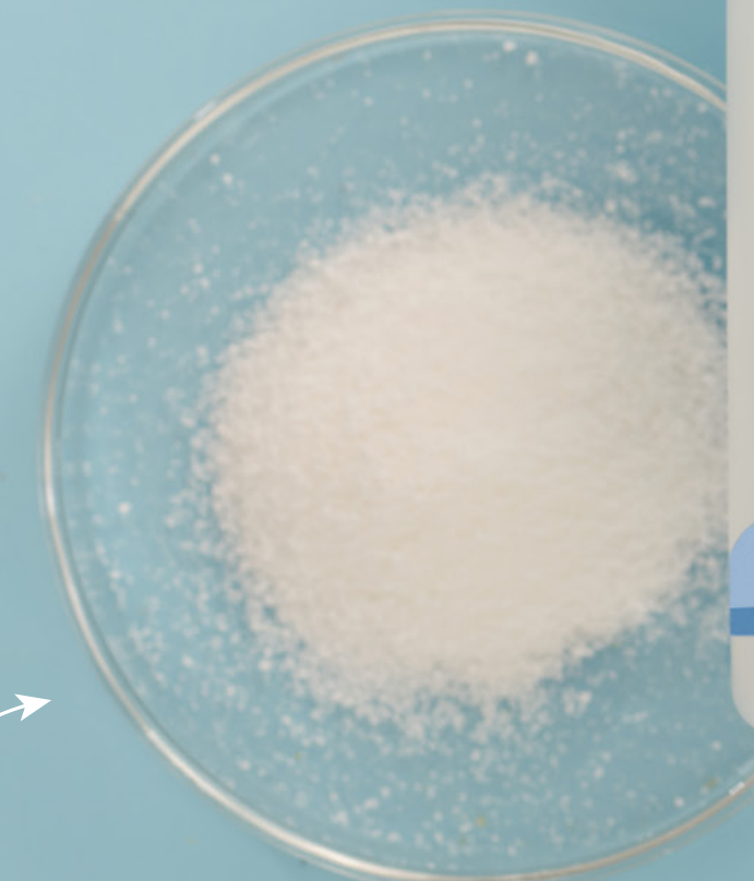
Vegetarian Glucosamine Hydrochloride