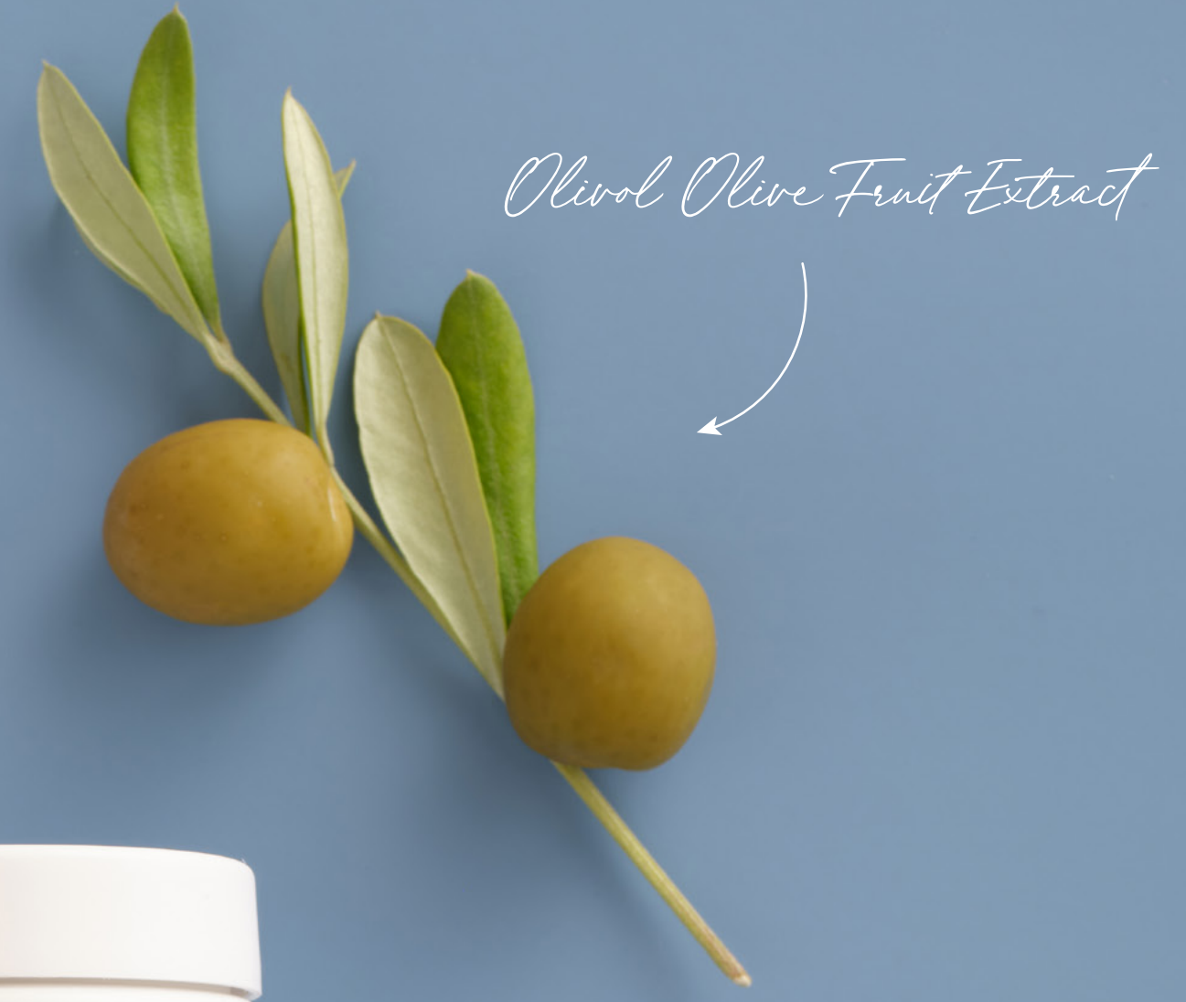
Olivol Olive Fruit Extract