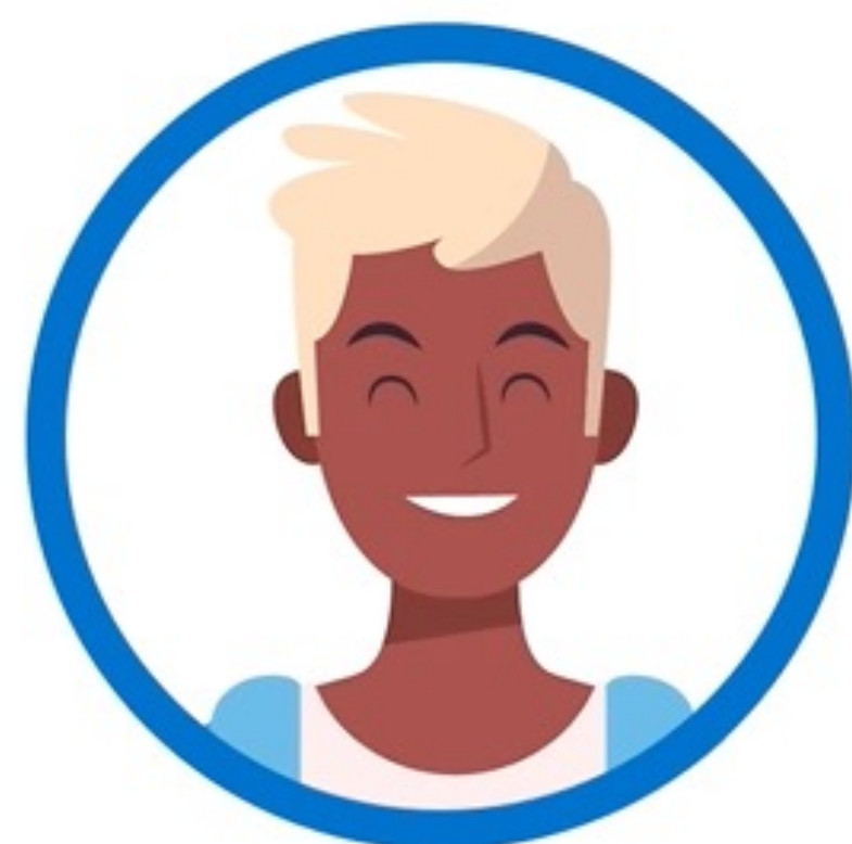
New USANA Affiliate