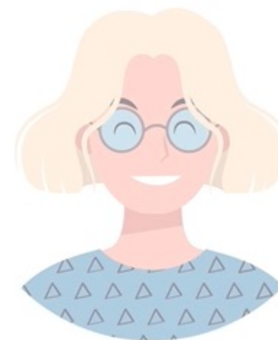
Experienced USANA Affiliate