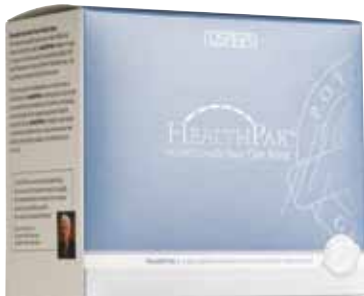
ITEM# 100 AUST L 163346