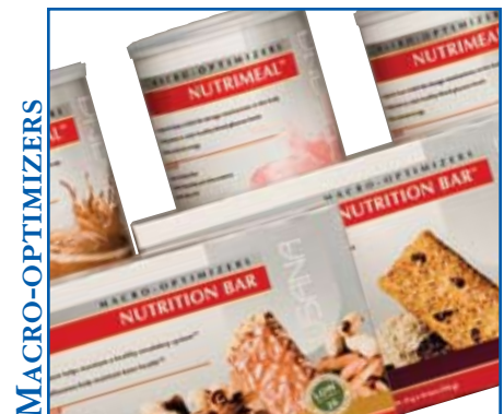
U.S. product shown