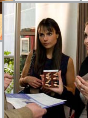
Actress Jordanna Brewster Fast & Furious