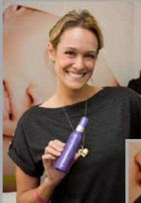
Actress Sean Faris Forever Strong