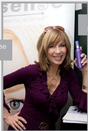
TV Personality Leeza Gibbons