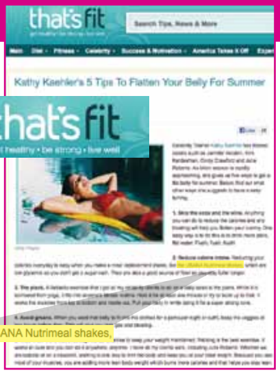
the USANA Nutrimeal shakes,