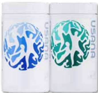
Essentials™—Vitamin, Mineral & Antioxidant Supplements ITEM# 101

Founder and Chairman, USANA Health Sciences, Inc. Recipient of the Albert Einstein Award in the Life Sciences, 2007